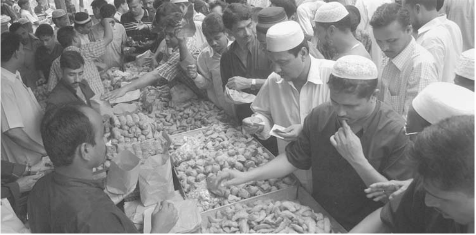
Bangladesh vendors sell fried snacks at the Chowk Bazaar Market, Dhaka, Bangladesh.